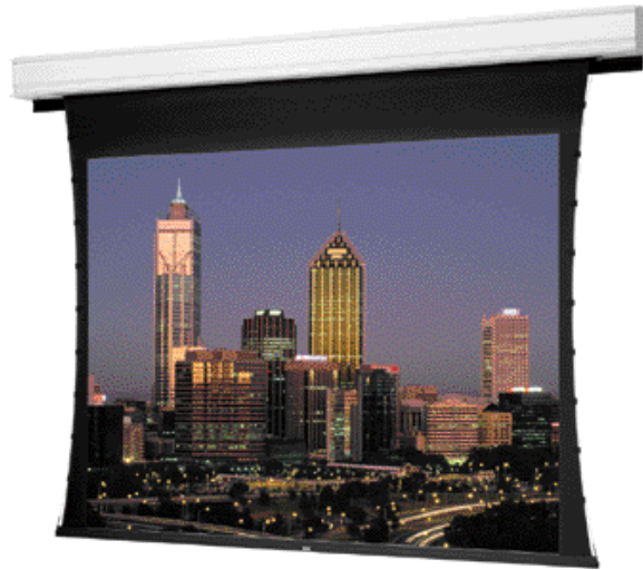
All fabrics will be seamless.

Dual motors with one operating the door and one operating the screen.