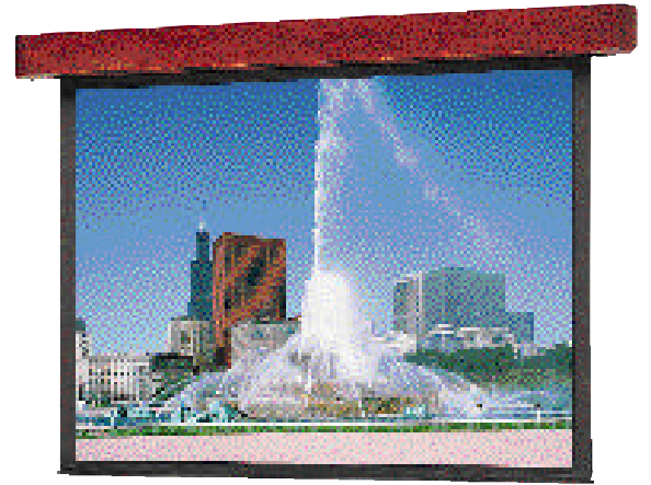
Matte White and Glass Beaded fabrics will be seamless in all sizes.