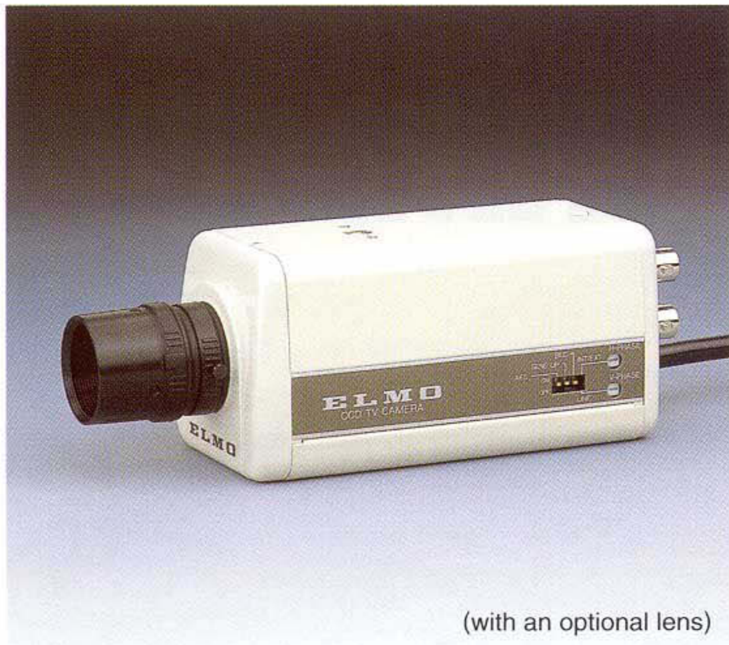
(with an optional lens)